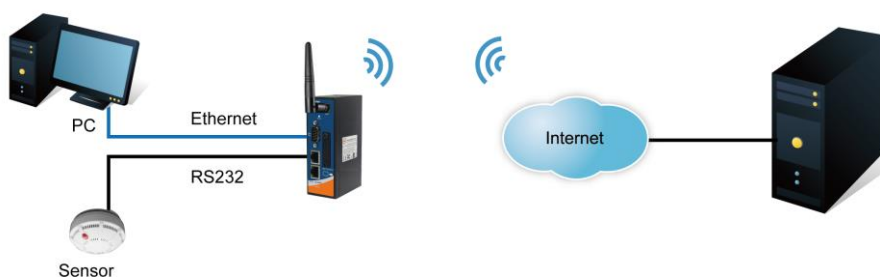
M2M Gateway Connection

IMG-4312-4G support 2G/3.5G/LTE Modem dial up. The utility- M2M-Tool which is used to manage and monitor all of the serial ports on IMG-4312-4G.