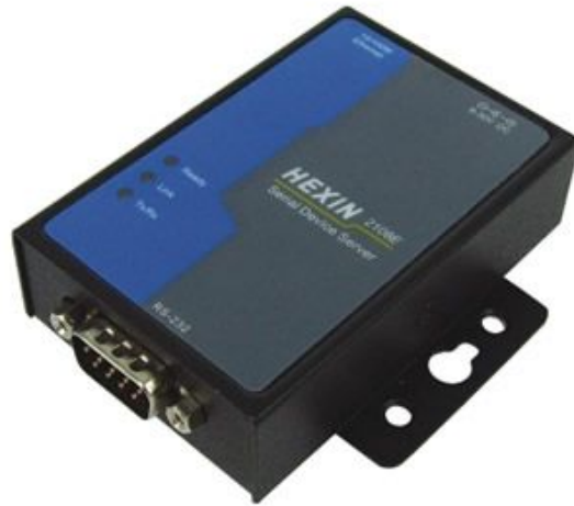
HXSP-2108E-A RS-232 to Ethernet TCP/IP Serial Device Server