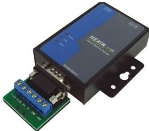
HXSP-2108E-B RS-485/RS-422 to Ethernet TCP/IP Serial Device Server