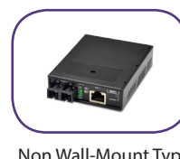
Non Wall-Mount Type

FMC - 1000S-PH- WM - Example: FMC - 1000S-PH- WM - SC002